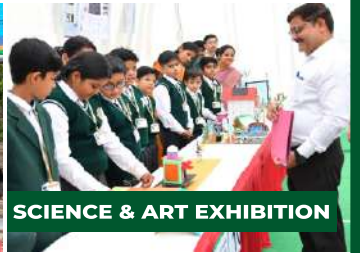
SCIENCE & ART EXHIBITION