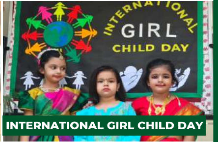
INTERNATIONAL GIRL CHILD DAY