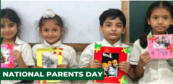
NATIONAL PARENTS DAY