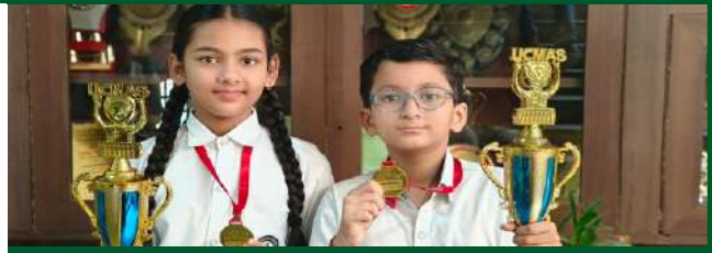
UCMAS -STATE LEVEL ABACUS & MENTAL ARITHMETIC COMPETITION