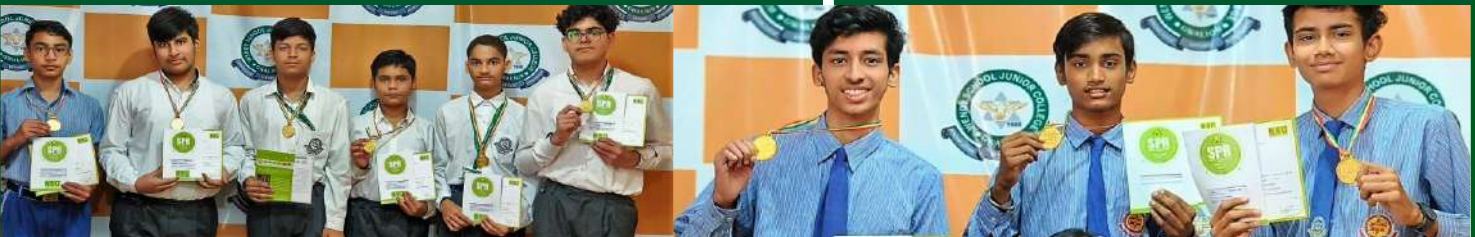
INTERNATIONAL SCIENCE OLYMPIAD (GOLD MEDALIST)