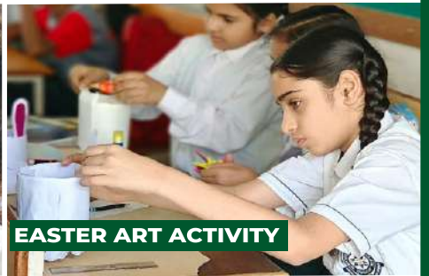
EASTER ART ACTIVITY