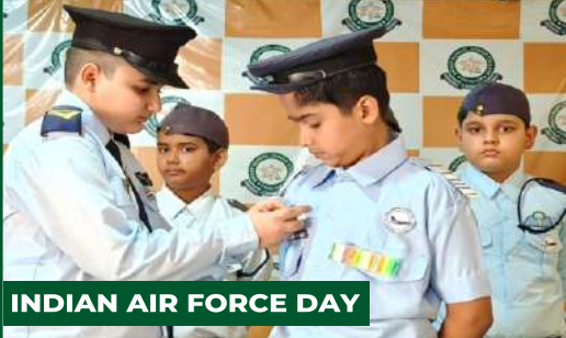
INDIAN AIR FORCE DAY