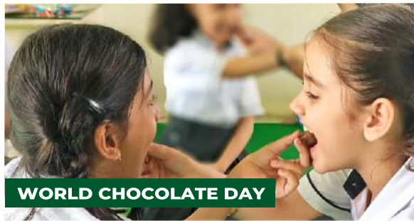
WORLD CHOCOLATE DAY