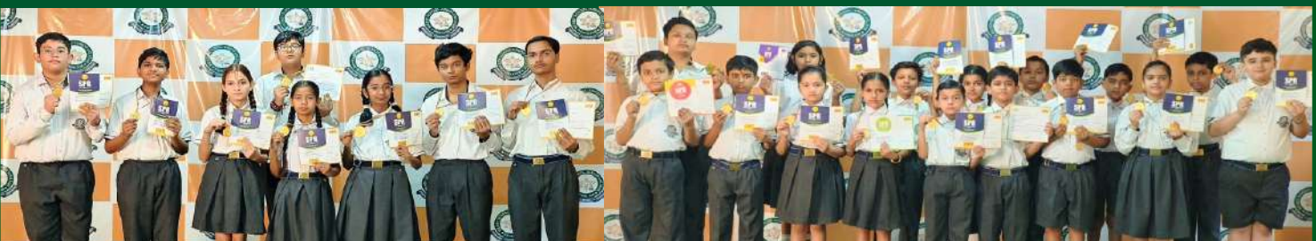
INTERNATIONAL MATHEMATICS OLYMPIAD (GOLD MEDALIST)